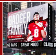
National Signing Day Billboards Feb 2023