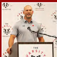
Launch Press Conference Sept 2022