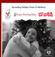
Holiday NIL Campaigns Dec 2022